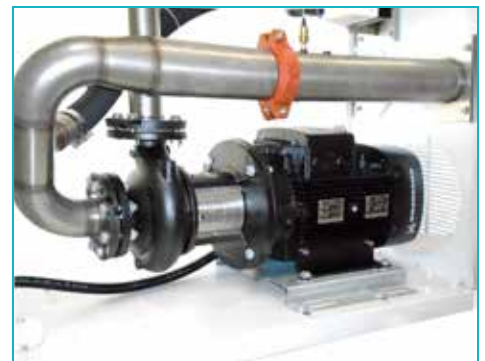
135 M 3 /HR (600 GPM) HIGH FLOW BOOSTER MODEL

Standard motorized servo modulating valves for ultimate temperature control.