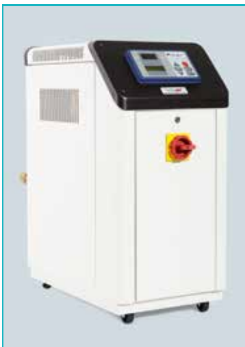
DUAL ZONE SHOWN